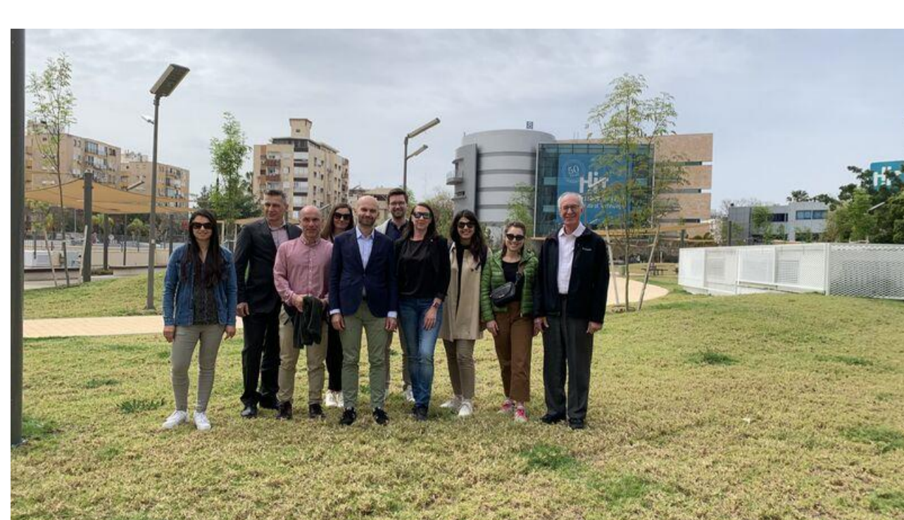
Partners meetings Holon, Tel Aviv Kick off Meeting Ph.2