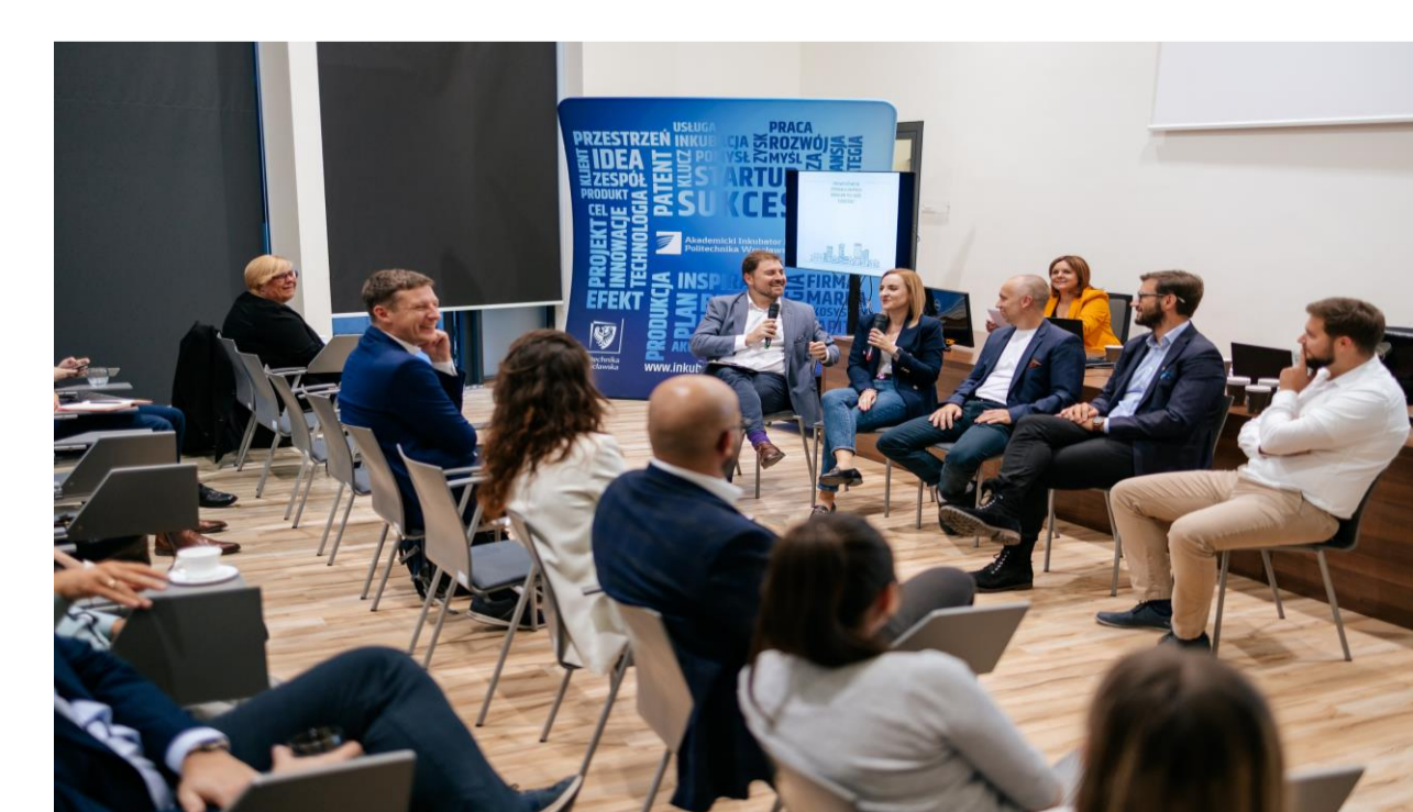
Wroclaw Tech Date #1

For questions please contact: hei-innovate@eitmanufacturing.eu