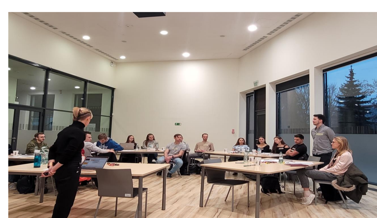
Preincubation Program GROW UP TECH #1