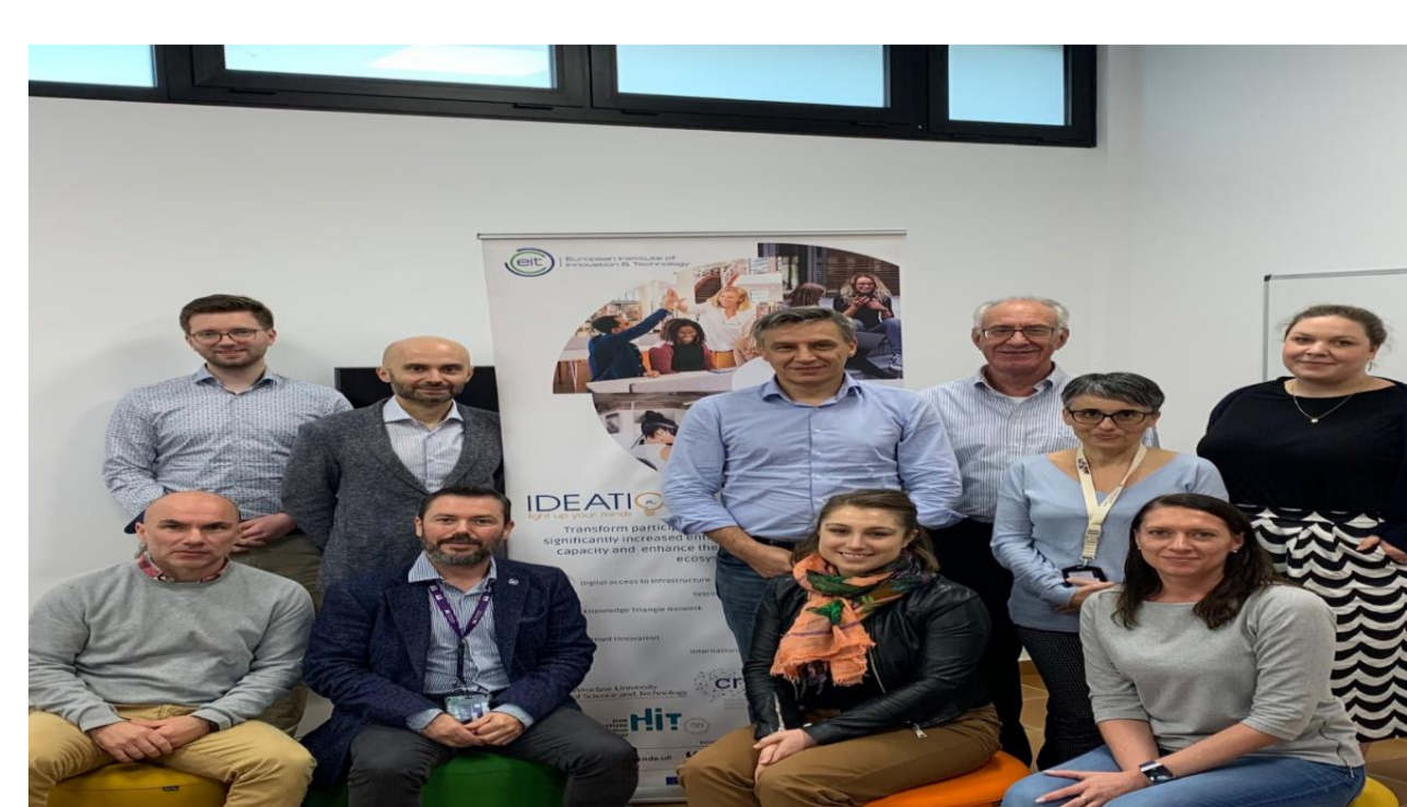
Partners meetings La Laguna, Tenerife Wrap up Phase 1